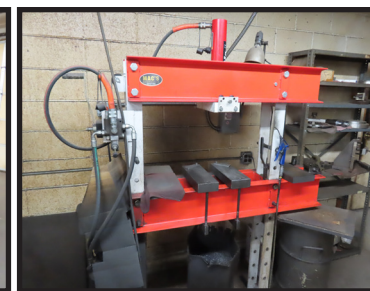
HYD. H-FRAME PRESS