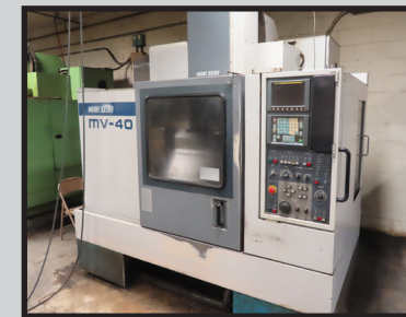
1991 MORI SEIKI MV-40B