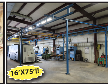
GORBEL CRANE SYSTEM