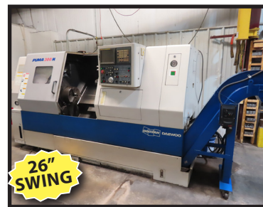
2006 DOOSAN 300MC