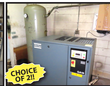
ATLAS COPCO 25 HP SCREW