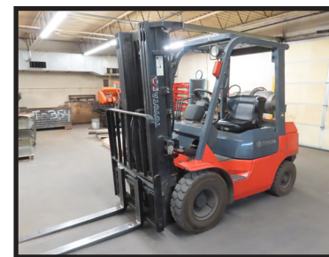
TOYOTA 5,000 LB