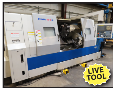
2007 DOOSAN 400MC