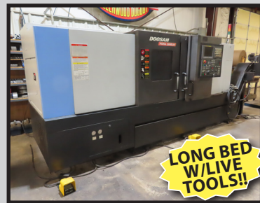
2010 DOOSAN 2600LM