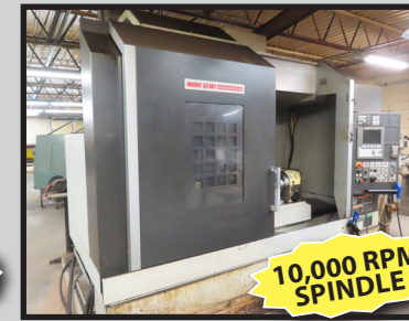
2007 DURAVERTICAL 5100