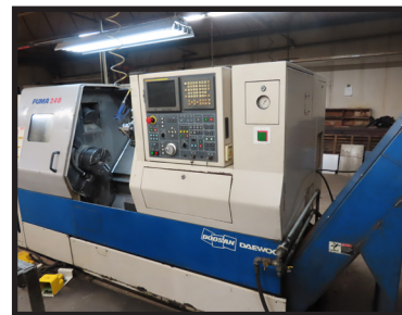
2004 PUMA 240L