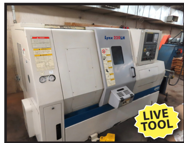
2007 LYNX 220LMA