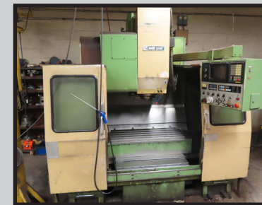
MORI SEIKI MV-40