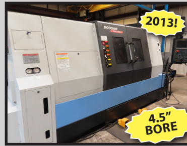
2013 DOOSAN 400MB