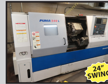
2004 PUMA 240L