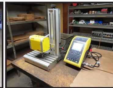
TECHNOMARK MULTI 4/120