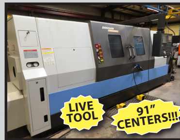
2007 DOOSAN 400LMC