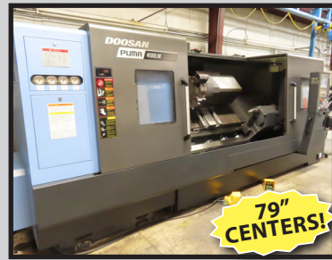
2018 DOOSAN 4100LMB

DIRECTIONS: In Tulsa, between Yale & Harvard, just south of 11th St. (Route 66) on Joplin Ave. SIGNS WILL BE POSTED.