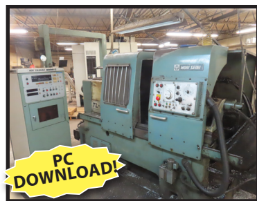
MORI SEIKI TL-3A