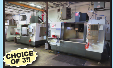
CHOICE OF 3!!