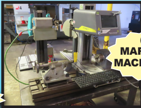
(3) MARKING MACHINES!!