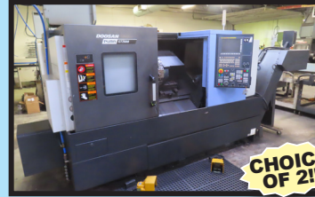
CHOICE OF 2!!