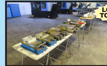
LOTS OF TOOLING!