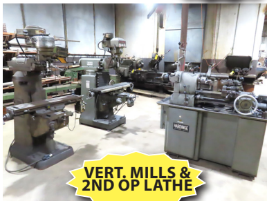
VERT. MILLS & 2ND OP LATHE