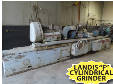
LANDIS "F" CYLINDRICAL GRINDER