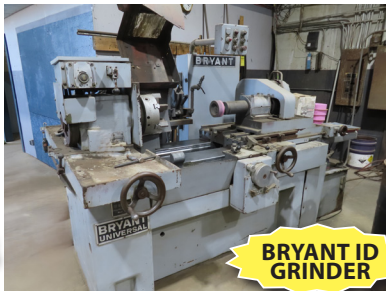
BRYANT ID GRINDER