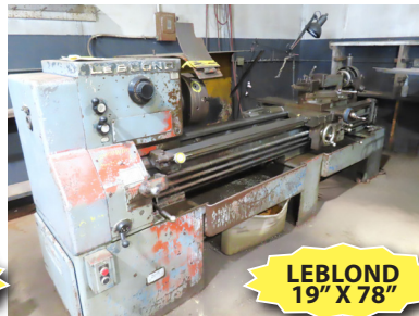
LEBLOND 19" X 78"