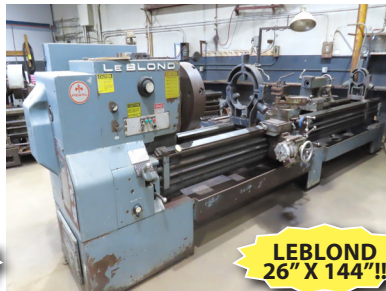
LEBLOND 26" X 144"!!