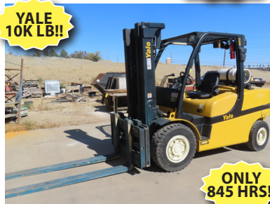
YALE 10K LB!!