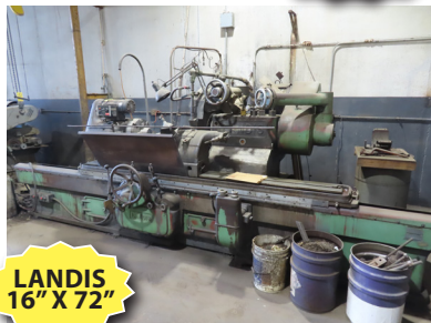
LANDIS 16" X 72"