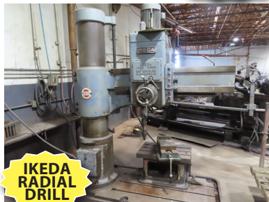
IKEDA RADIAL DRILL