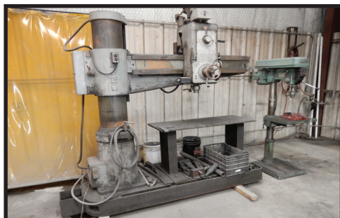
CASER 4' x 11"

EDWARDS, M# JAWS IV , 100-TON CAP, HYDRAULIC, MATERIAL END STOP, FOOT SWITCHES * WHITNEY 70-TON C-FRAME PUNCH, 8" THROAT, W/HYD. POWER SUPPLY * WHITNEY M# 200 6" CORNER NOTCHER