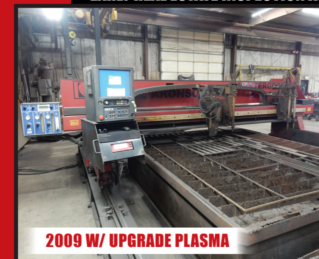
2009 W/ UPGRADE PLASMA

INSPECTION: Wednesday • June 26th • 9:00AM-4:00PM EARLY REAL ESTATE INSPECTION AVAILABLE BY APPT • 918.408.6052