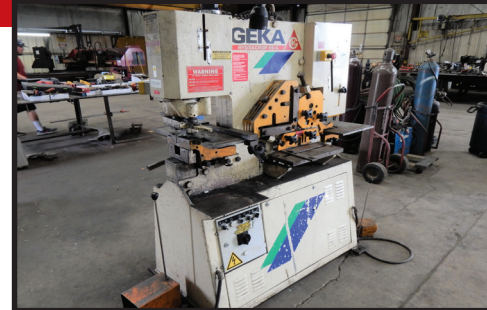
GEKA 50 TON