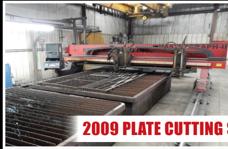
2009 PLATE CUTTING SYSTEM