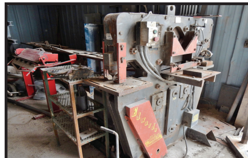
EDWARDS 100 TON