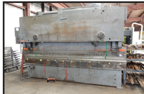
HTC 150 TON x 12'