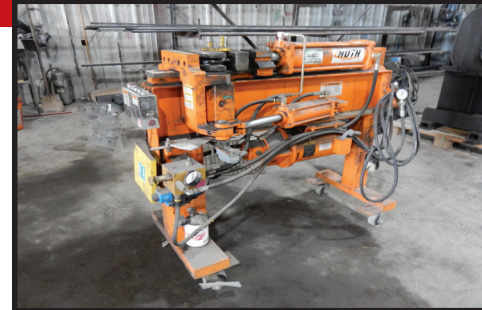
HUTH TUBE BENDER