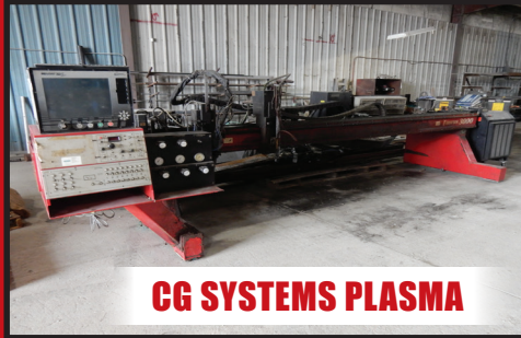
CG SYSTEMS PLASMA