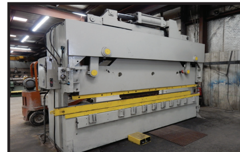
DELAURICE 225 TON x 13'