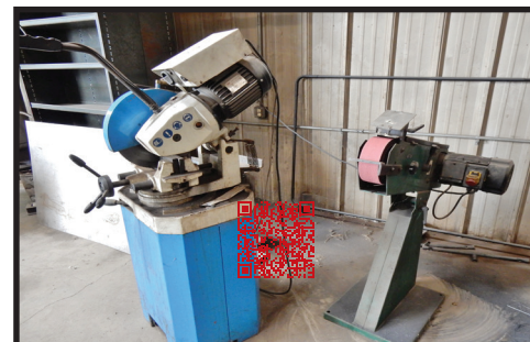
SAWS AND SANDERS

ALUMINUM WHEELS, 22' STEEL FLATBED W/ HEADACHE RACK * 1939 PLYMOUTH 2-DR HARDTOP BODY W/FRAME