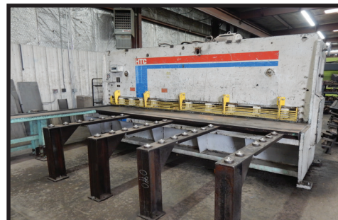
HTC 1/2" x 12'