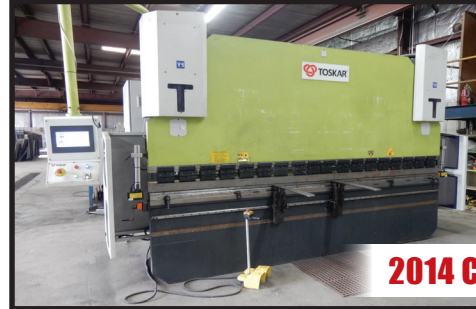
2014 CNC BRAKE