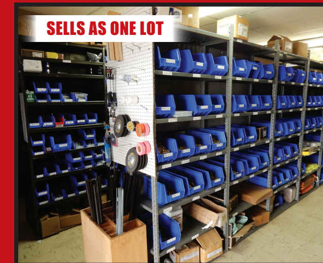
COMPLETE FASTNER INVENTORY WITH SHELVES