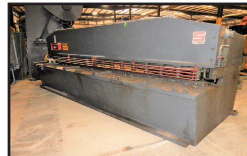
SUMMIT 1/4" x 12'