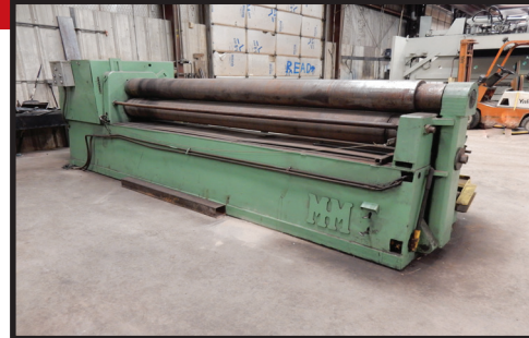
MONTGOMERY 1/4" x 10'