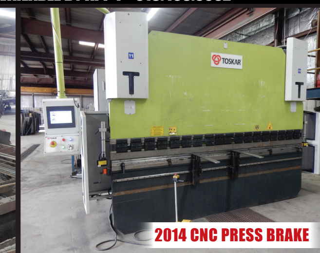
2014 CNC PRESS BRAKE