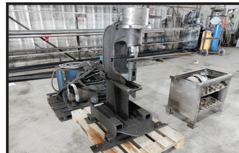
WHITNEY 70 TON