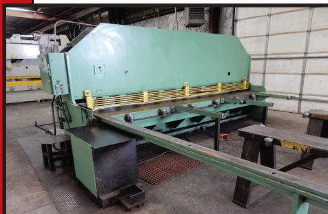
AMERICAN HERCULES 3/8" x 12'