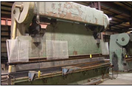
CHICAGO 750 X 20' TON PRESS BRAKE