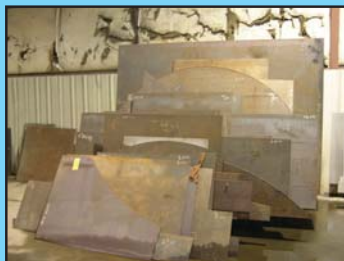
VIEW OF PLATE STEEL