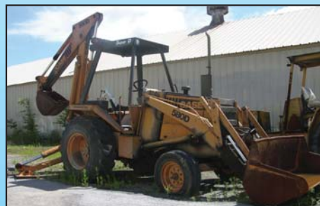
CASE 580D BACKHOE