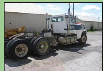
FORD LTL 9000 TRUCK TRACTOR