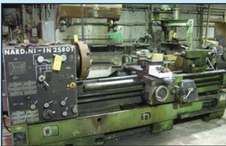
NARDINI 25" X 80" ENGINE LATHE