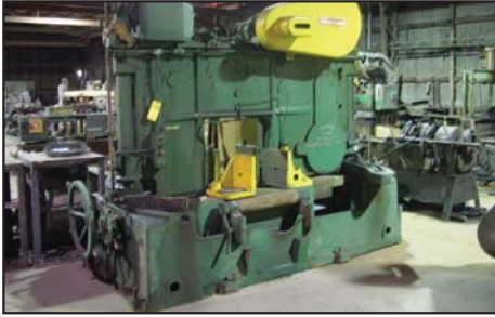
MARVEL M# 24 HACK SAW