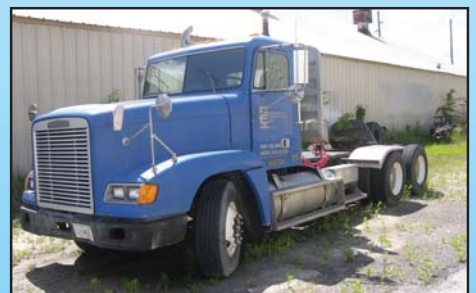
FREIGHTLINER TRUCK TRACTOR