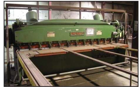
CINCINNATI 1/4" X 12' PLATE SHEAR