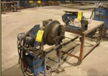
VIEW OS POSITIONERS