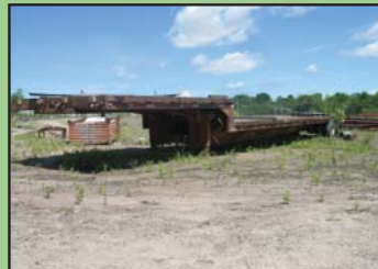
SINGLE DROP TRAILER