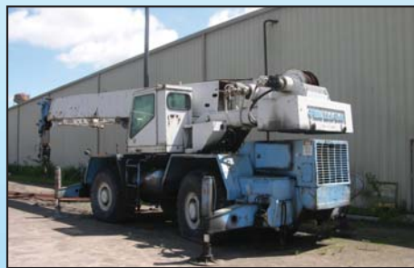
LINKBELT 80 TON R.T. CRANE