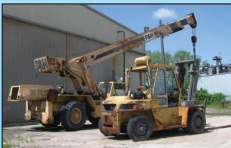
VIEW OF P&H TRUCK CRANE & LIFT