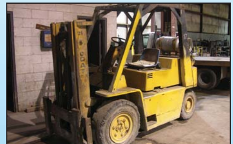
CAT. 5000 LB. FORKLIFT