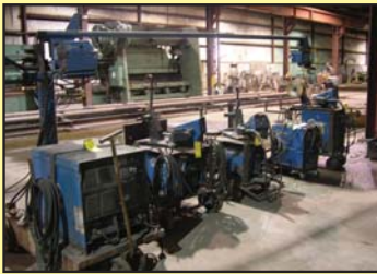
VIEW OF WELDERS