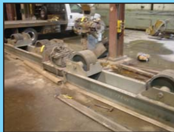
VIEW OF TURNING ROLLS