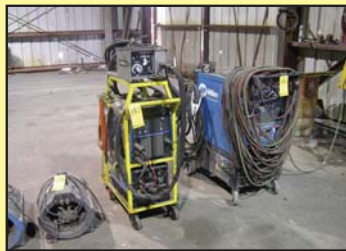
VIEW OF WELDERS