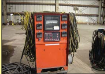
COOPERMASTER III STRESS RELIEVING P.S.