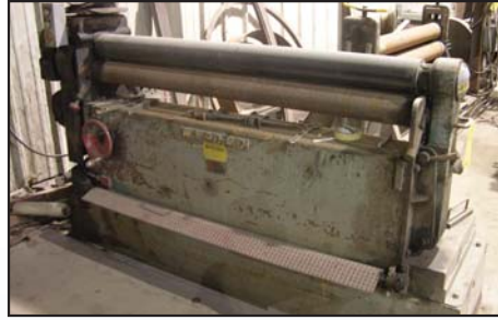
WYSONG 60" X 10 GA. PLATE ROLLS