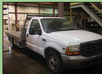
FORD 350 XL 1 TON TRUCK