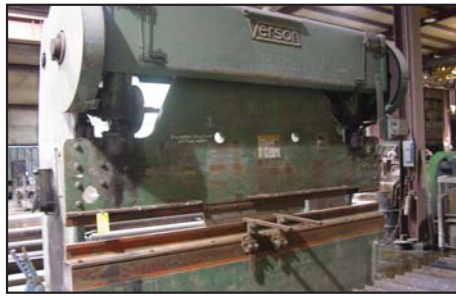
VERSON 150 X 12' TON PRESS BRAKE