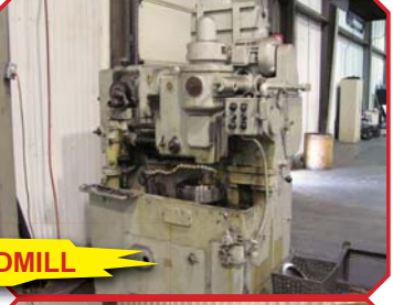
GEAR GRINDERS, HOBBS & THREADMILL