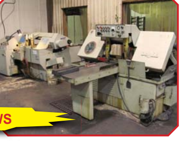
PRESS BRAKES, SHEARS & SAWS