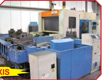
DUAL PALLET CNC'S W/4TH AXIS