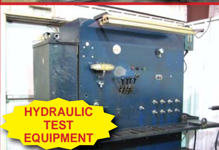
HYDRAULIC TEST EQUIPMENT

PLEASE ATTEND THE A-STATE ASPHALT AUCTION, BEGINNING AT 12:00 NOON THIS SAME DAY!! REGISTRATION WILL BE HELD AT THE GORTON HYDRAULICS LOCATION.