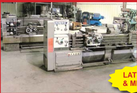
LATHES & MILLS